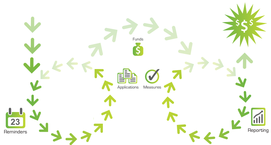
Grants Management Process

Imagine a grants management system that empowers you to oversee your community, your giving and your impact, using the processes that work for you. That's SmartSimple's GMS360° .